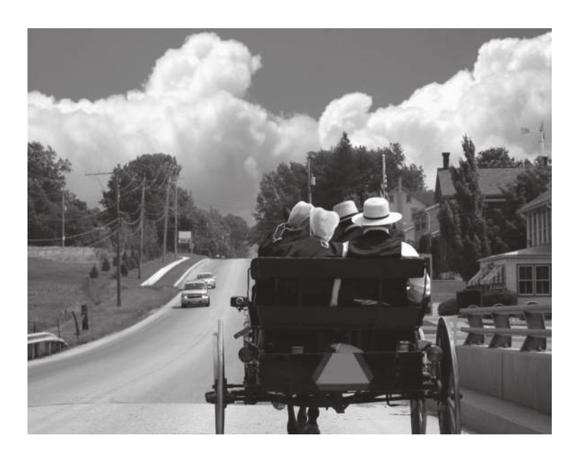
Image of the Amish travelling in a courting buggy on a road in Pennsylvania

The Amish are a religious community in Pennsylvania, USA. Their strict religious beliefs mean they reject some features of modern lifestyles, like the motor car. Individuals who do not conform to the norms of the group can face ostracism by their community. The Amish have become a tourist attraction because their way of life is so different. There can be conflict between them and the tourists as their religion means they are not happy to be photographed.